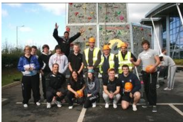
Photograph: Students and staff at Nantgarw campus challenge staff from Laing O' Rourke on the Climbing Wall