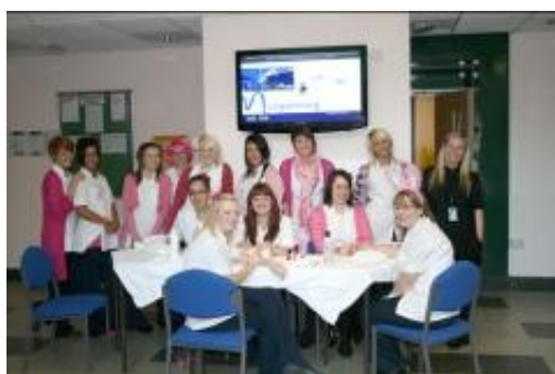
Photograph: Pink nail painting!