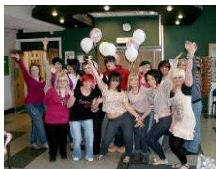
Photograph: In the Pink!