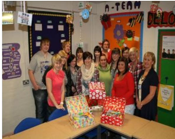
Photograph: Childcare students filling the boxes

Last year, almost 1.2 million shoeboxes were filled with gifts and goodies and sent children who need them in some of the toughest parts of the world.