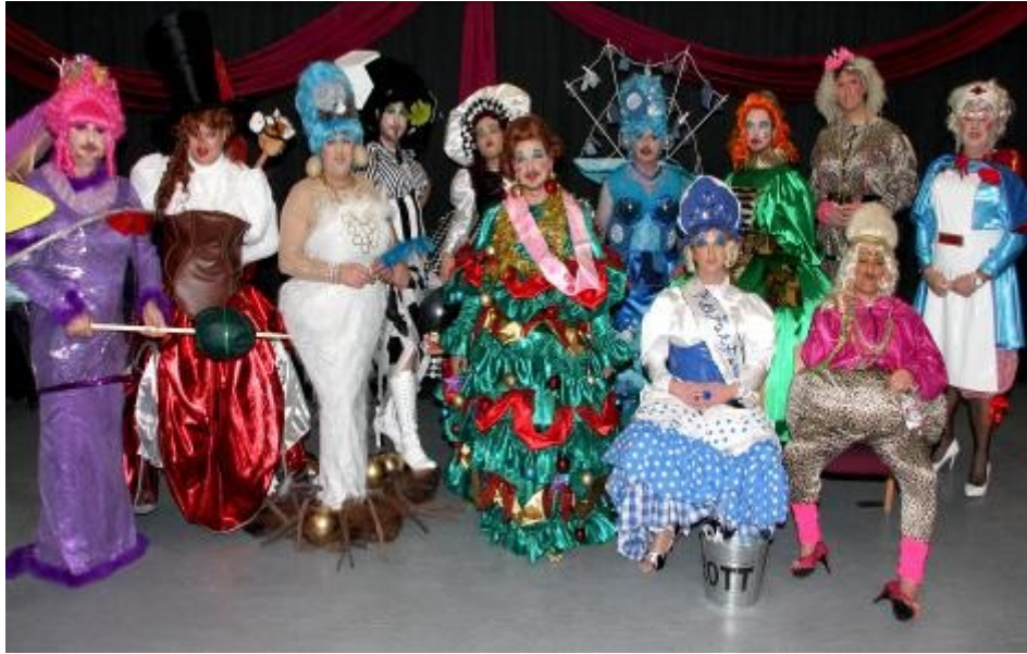
Photograph: Hopeful dames!

Flamboyant characters of all shapes and sizes strutted their stuff at the college hoping to be crowned the ultimate pantomime dame.