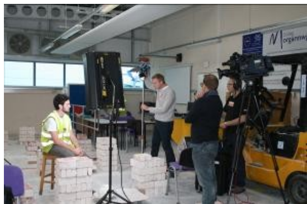
Photograph: Filming at Nantgarw campus for UHOVI DVD