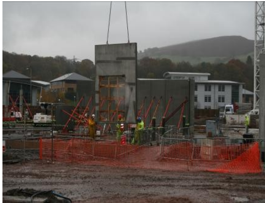
Photograph: Construction work on the Taf Ely Learning Campus is on target

Construction of the college's £40 million Taf Ely Learning Campus is well underway. A second Community Forum was held at the Nantgarw Campus on Tuesday November 23rd; 5:00 - 7:30. where residents and organisations in the area were invited to receive an update on the progress and current status of the Project. Drawings, plans, a 'fly through' and a 3D model of the new building were displayed and visitors had the opportunity to meet the Project Team and ask questions. The construction of Coleg Morgannwg's new Taf Ely Learning Campus at Nantgarw is on schedule; piling work has been completed and the erection of the main structural columns is in progress. The Project Team are eager to engage with all stakeholder groups' especially local residents and business owners, to establish strong relationships with the community throughout the construction of the building.