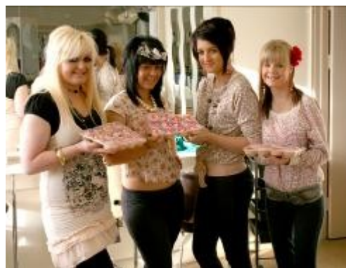
Photograph: and Pink cakes!

A number of activities took place on all campuses to fundraise for Breast Cancer Awareness - pink cakes, pink nails and pink attire were evident throughout the college! College staff and students on the Nantgarw campus joined with Laing O' Rourke staff from the Taf Ely Learning Campus project for a Climbing Wall Challenge.